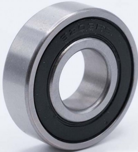
6206 rs bearing