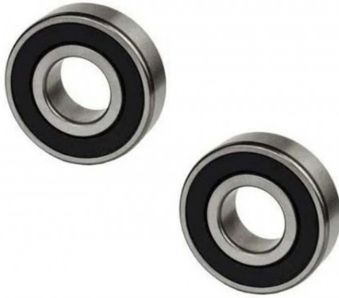
6206 rs bearing