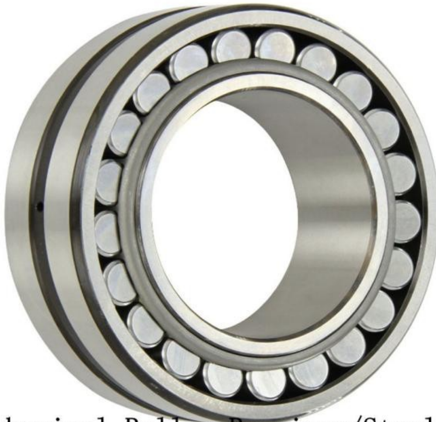
Spherical Roller Bearings/Steel Cage

In summary, the future of spherical roller bearings with steel cage technology is bright, with emerging trends and innovations poised to revolutionize the way these bearings are designed, manufactured, and utilized across various industrial sectors. By staying at the forefront of technological advancements and prioritizing research and development, stakeholders can optimize performance, enhance efficiency, and ensure the continued success of steel cage bearings in the years to come.